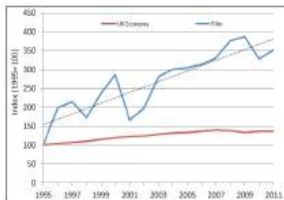
Figure 2: Gross value added in the UK film industry 5

6.7 Meanwhile, the UK film industry has grown strongly over the last decade – with inward investing production making up over half of the sector – as illustrated by this table for Oxford Economics – The Economic Impact of the UK Film Industry 2012.